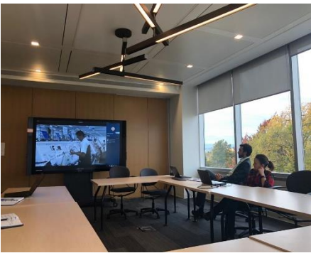
IMAGE 5 AND 6. 525 Superior Street: Sharing of information and presentation of B.C. strategies and actions