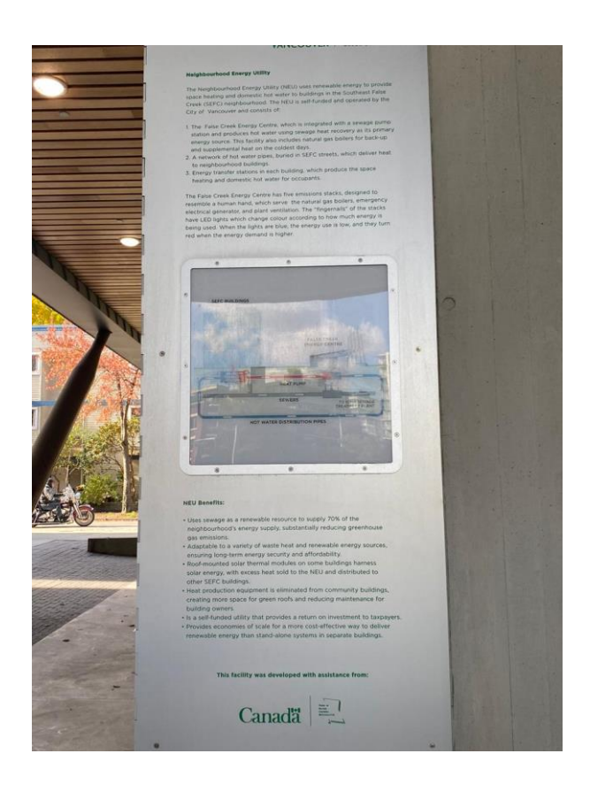
IMAGE 2. Neighbourhood Energy Utility (NEU): an example of renewable energy, efficiency, and distributed generation

IMAGE 1. Yucatan and British Columbia working together: Members of the secondment and their Canadian host