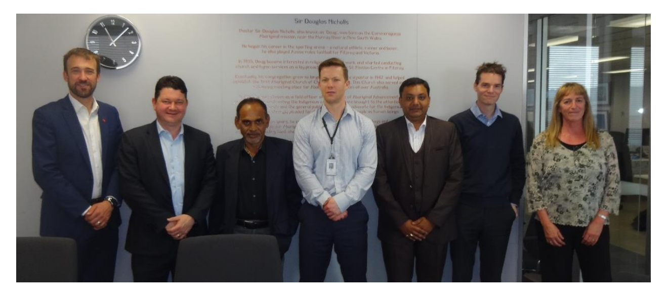
Site Visit - University of Adelaide and Lunch at Art Gallery of South Australia

The objective of visiting the UA was to discuss Renewable Energy Research Projects and other opportunities in areas of education and climate change.