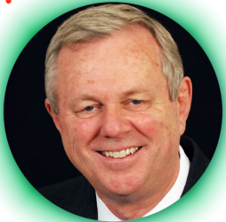
Hon Mike Rann AC, CNZM, Chair of the UK Board of the Climate Group