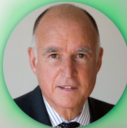
Jerry Brown , Global Ambassador and Co-Founder, Under2 Coalition

The Under2 Coalition has come a long way since we launched it seven years ago, but our work is just getting started. If we're going to fully meet our potential, and do our part to combat the growing horror of global warming, the Climate Group Secretariat needs the engagement and support of every single member.