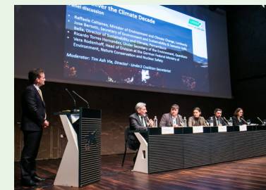
Under2 Coalition General Assembly, Madrid