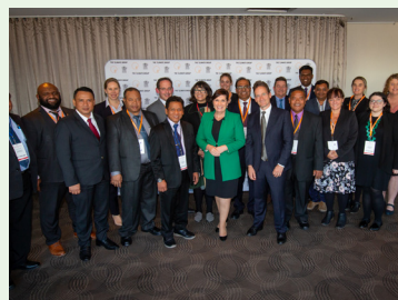
Asia-Pacific Climate Leadership Forum, Brisbane

Over the past year, the Under2 Coalition has worked to increase member engagement and showcase successes through attending and organizing events across the globe.