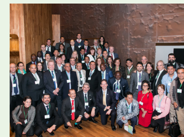
Under2 Coalition General Assembly, Madrid