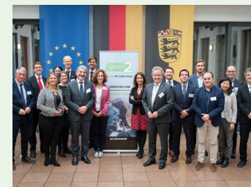
Under2 Coalition Europe Members' Meeting, Brussels