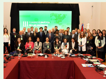
Climate Summit of the Americas, Santa Fe