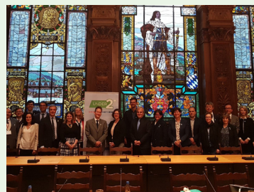
International Conference on Climate Action, Heidelberg