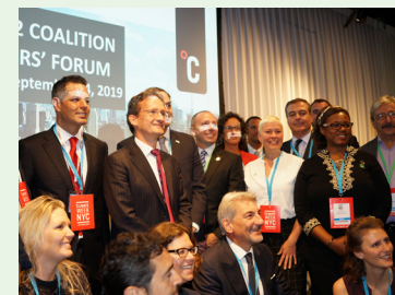
Climate Week NYC, Under2 Coalition Members' Forum, New York